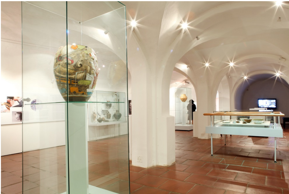
Fig.1 The Granary exhibition space where the Fired exhibition was on display. Andile Dyalvane's vessel, Views from the Studio , made in 2011, is on show in the front.

The exhibition was produced with a modest budget. For example, resources for new, custom-built exhibition cases were not available. Existing display cases needed to be reutilized, some of which required minor adaptations such as the addition of glass shelves. A number of flat cases originally intended for the display of books or photographs, were adapted to display smaller ceramic items and flatware best suited to being viewed from above. Despite these constraints, Fired was undertaken with an enthusiastic and optimistic spirit. Very importantly, the exhibition provided Iziko with an opportunity to showcase ceramics from its amalgamated holdings in a single display dedicated solely to ceramic art, one of the first combined exhibitions in a single medium of this type to take place following the Iziko formation.