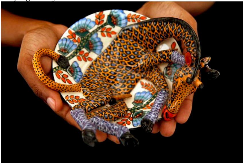
Fig.17 Giraffe-shaped bowl, sculpted by Somandla Ntshalintshali and painted by Punch Shabalala, Ardmore, KwaZulu-Natal, 2006. Held by Nomthandazo Mkonjiswa.

Contemporary South African ceramics also maintain a major connection with the African landscape - its natural surroundings, vivid colours, rich textures, and abundant animal and bird life. The Ardmore Ceramic Art Studio (active since 1985), for example, has become famous for its exuberant creations which strongly feature African design elements. Ardmore typically transforms utilitarian shapes into fanciful, brightly coloured works enhanced by figurative work. A number of works by Ardmore were included in Fired , ranging from a pair of tall candlesticks embellished with elephants and lions, a baboon-shaped lidded vessel, a small giraffe bowl (Fig.17), to a fish bowl and a female figure carrying a baby on her back.