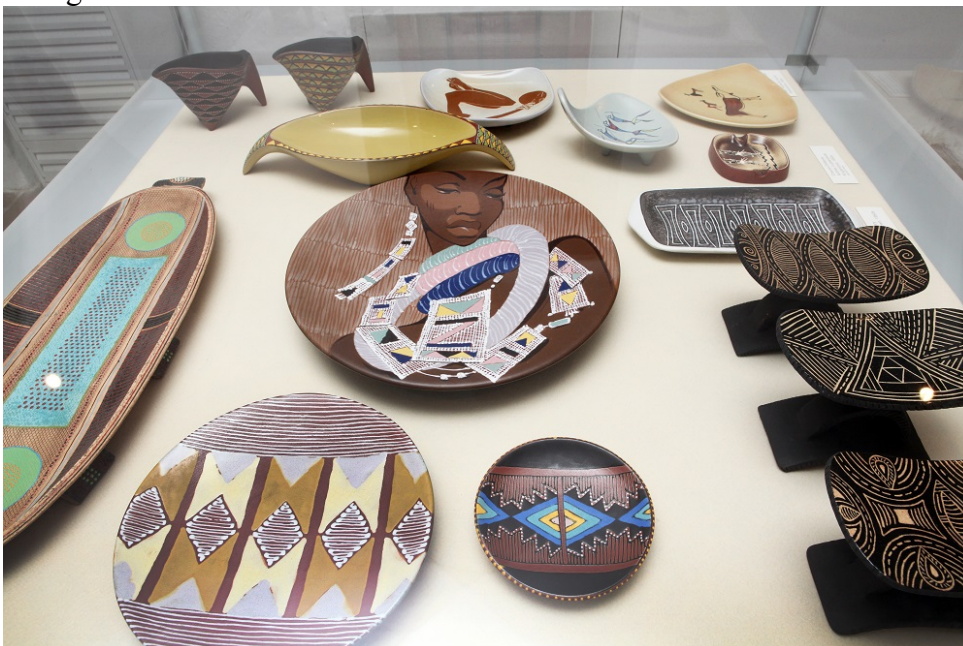
Fig.11 Designs on Africa display case showing Kalahari Studio ceramics of the 1950s (centre and back), a platter by Andile Dyalvane from 2004 (left), and headrests made by the Light from Africa Foundation in 2008 (right).

For the Designs on Africa display case, ceramic works were selected highlighting the strong influence of African designs on twentieth century South African ceramics (Fig.11). The aesthetics of geometric patterning, imagery of Africans, particularly figurative studies of women, and women dressed in traditional headgear and neck ornamentation, featured as popular design motifs, especially during the 1950s and 1960s.