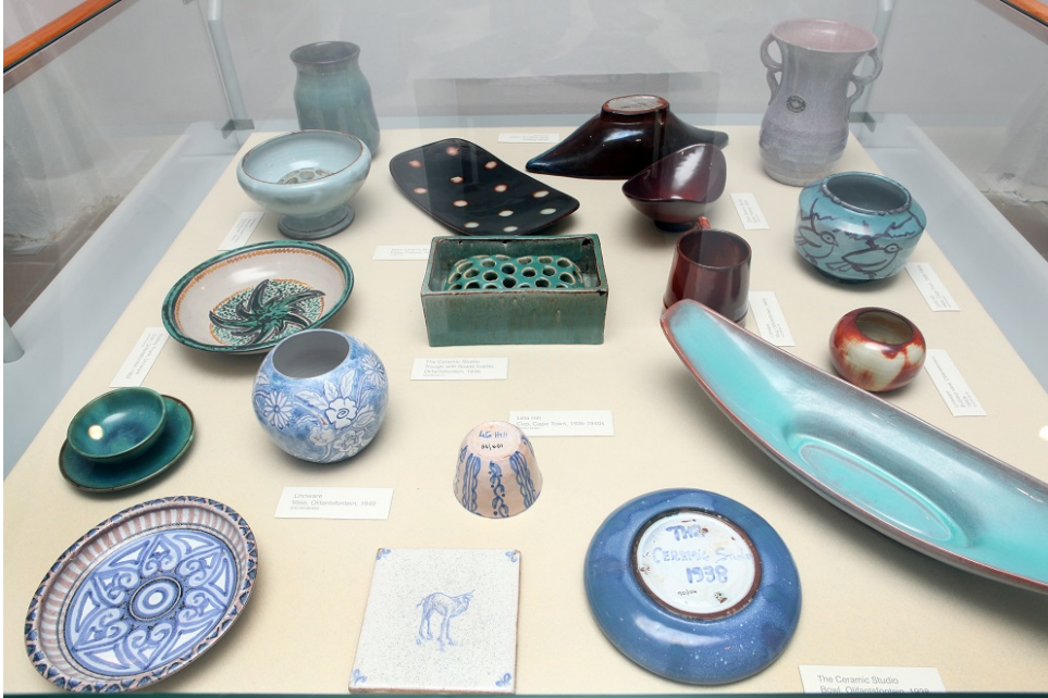
Fig.10 Ceramics made at various production potteries from the late 1930s to the 1970s.

By the 1950s the local ceramics industry consisted of over forty potteries, mostly established in urban centres throughout South Africa. During the late 1950s, however, deregulation of government import tariffs and quotas, and ‘dumping’ of cheap ceramics from Japan and the USA resulted in the bankruptcy of many of these smaller potteries. 21