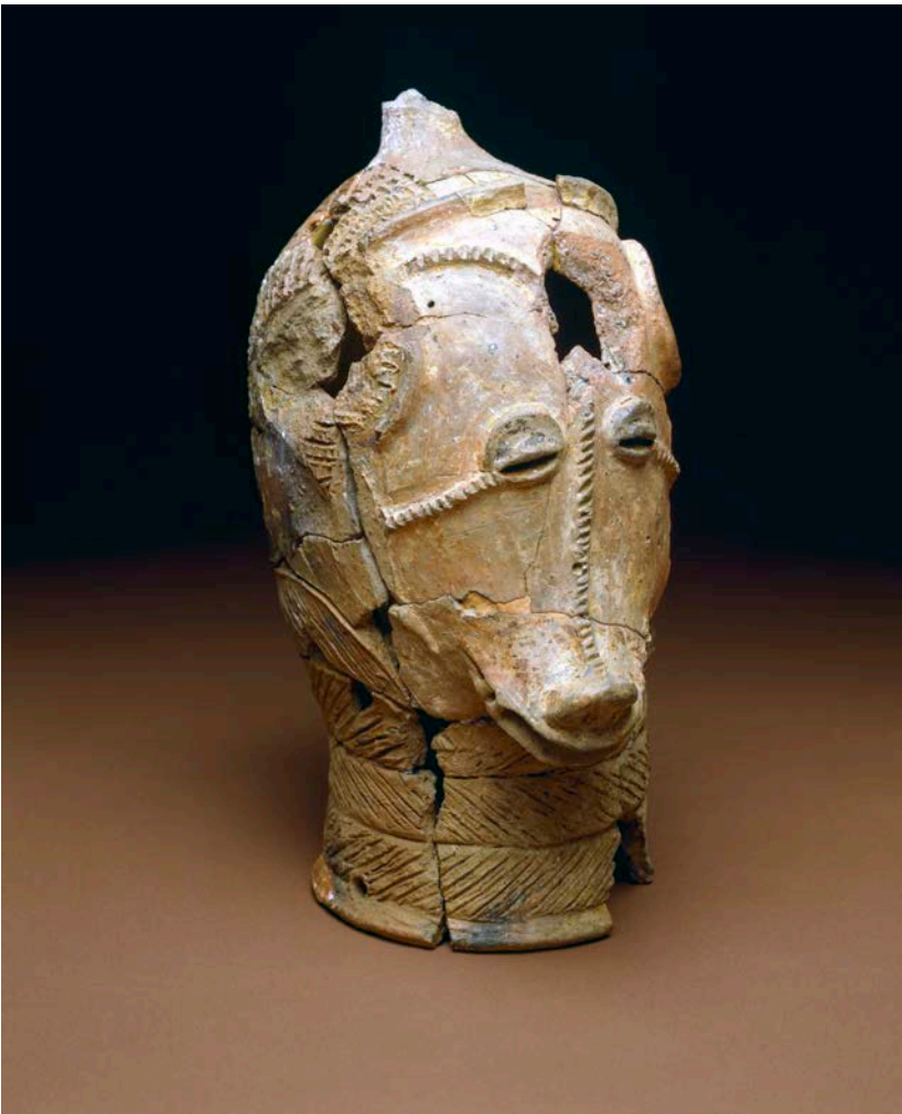
Fig.8 One of the iconic Lydenburg heads that was on exhibition in Fired . On loan from the University of Cape Town.

The heads have been dated to around 750 CE. Their special modelled features include cowrie-shaped eyes, wide mouths, raised bars across the forehead defining the hairline or representing scarification; incised bands hatched around the necks echo the decoration applied to domestic pottery found at the site. The precise use and meaning of these remarkable objects are not clear but they were possibly ritual objects used in initiation ceremonies. They reveal a complex aesthetic ability amongst early farming communities in southern Africa, at least a thousand years before European colonisation. 15