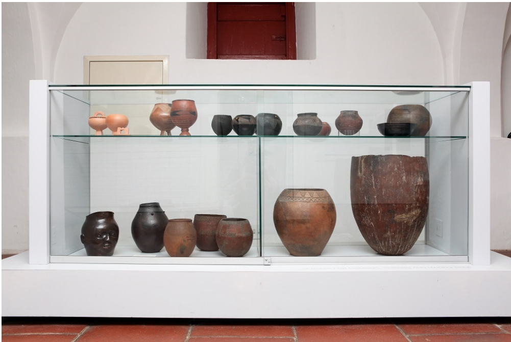
Fig.3 A selection of historical and contemporary vessels used for the making, serving and drinking of beer.

Most of the exhibited works were decorated with impressions of geometrical lines impressed into the soft clay surface prior to firing. Decoration was also applied to the surfaces of some of the vessels through the addition of shaped pellets of clay or amasumpa . This distinctive technique was often utilized for vessels made in the KwaZulu-Natal area, and may allude to a style of body patterning.