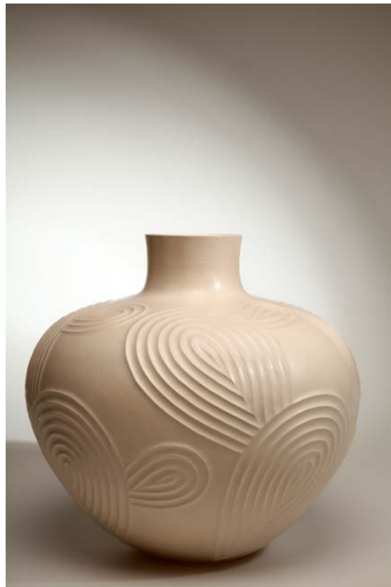
Fig.6 Vessel by Ian Garrett, titled Succulent , made in Swellendam, 2011.