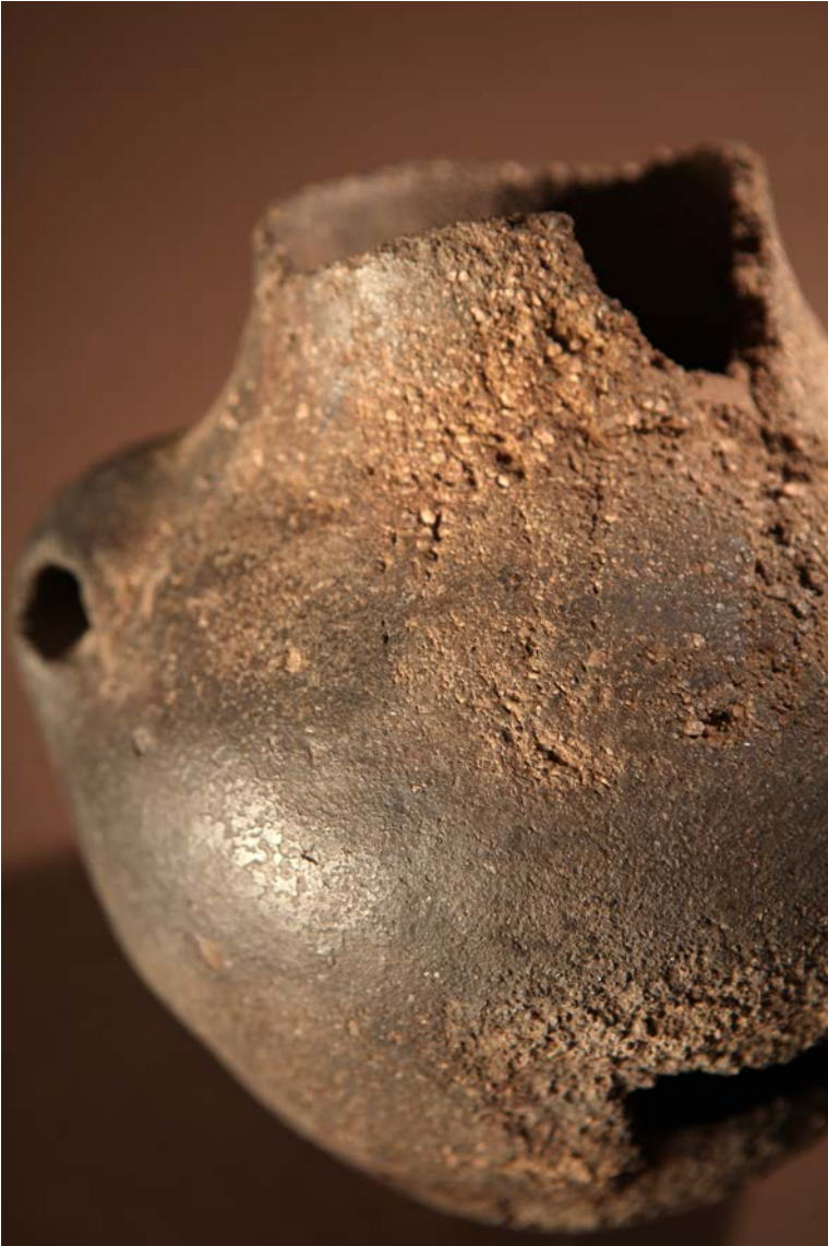
Fig.7 Small conical-based vessel with lugs, and decorated with fine incised lines at the neck, Khoekhoe, found at Blaauwbergstrand.