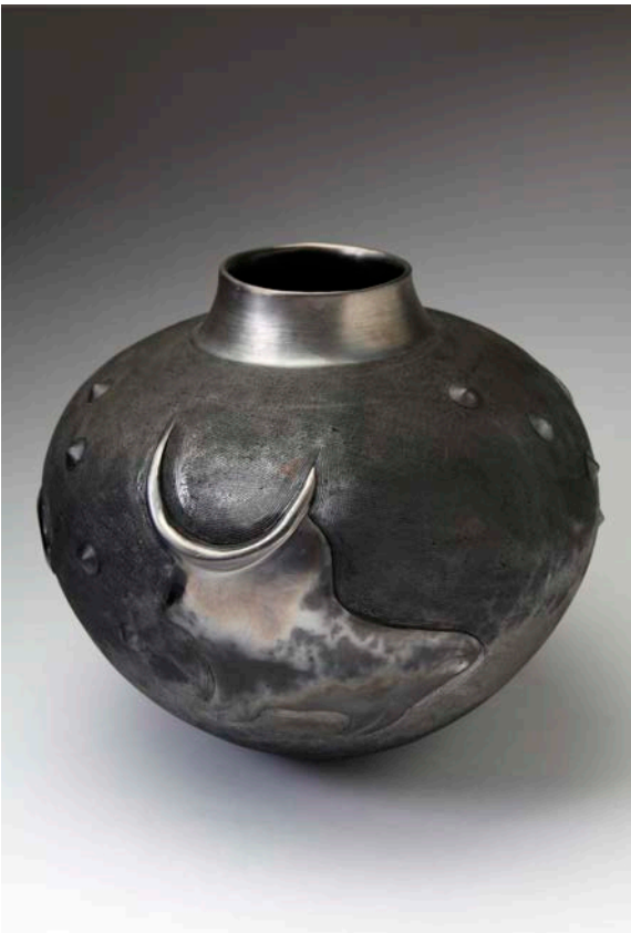
Fig.5 Vessel by Clive Sithole, made in 2008 in KwaZulu-Natal.