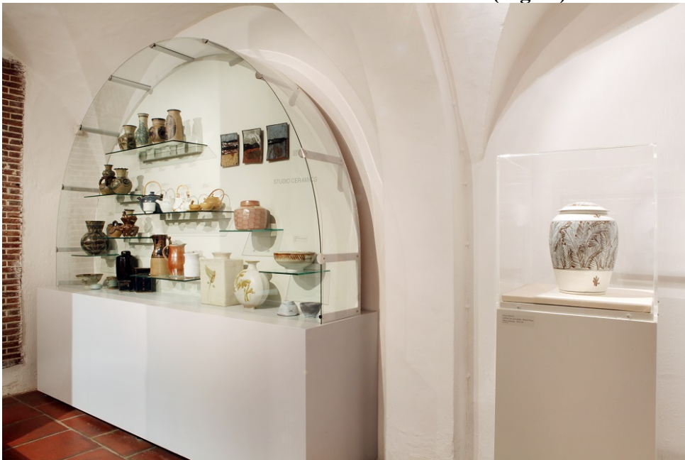
Fig.12 Studio Ceramics display case with Rorke's Drift ceramic vessels (inside domed case, left). Lidded porcelain jar made by Esias Bosch during the late 1970s (display case, right).

Works by a number of potteries referred to as Community Economic Development (CED) potteries, 25 were also integrated into the Studio ceramics display case. Best-known amongst these potteries are Kolonyama and Thaba Bosigo of Lesotho, Mantenga Crafts of Swaziland, and the Rorke's Drift Art and Craft Centre of KwaZulu-Natal ( Fig.12 ).